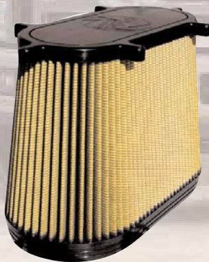
Pro-GUARD 7™ P/N 71-10107 for maximum protection

Unique design is easy to install and remove for cleaning.