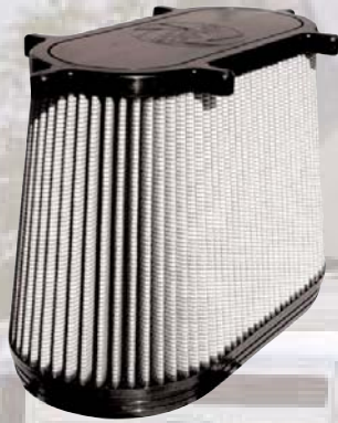
Pro Dry S™ P/N 11-10107 for maximum convenience

Unique design is easy to install and remove for cleaning.